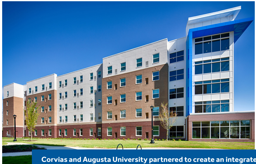
Corvias and Augusta University partnered to create an integrated housing program in one residential community.

Corvias partnered with Augusta University (AU) to develop, construct, renovate, manage, and maintain a new residential community, serving both undergraduate and graduate students, on the downtown medical campus.